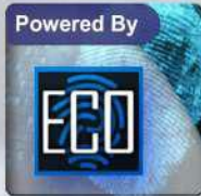
ECO Timeprint Software